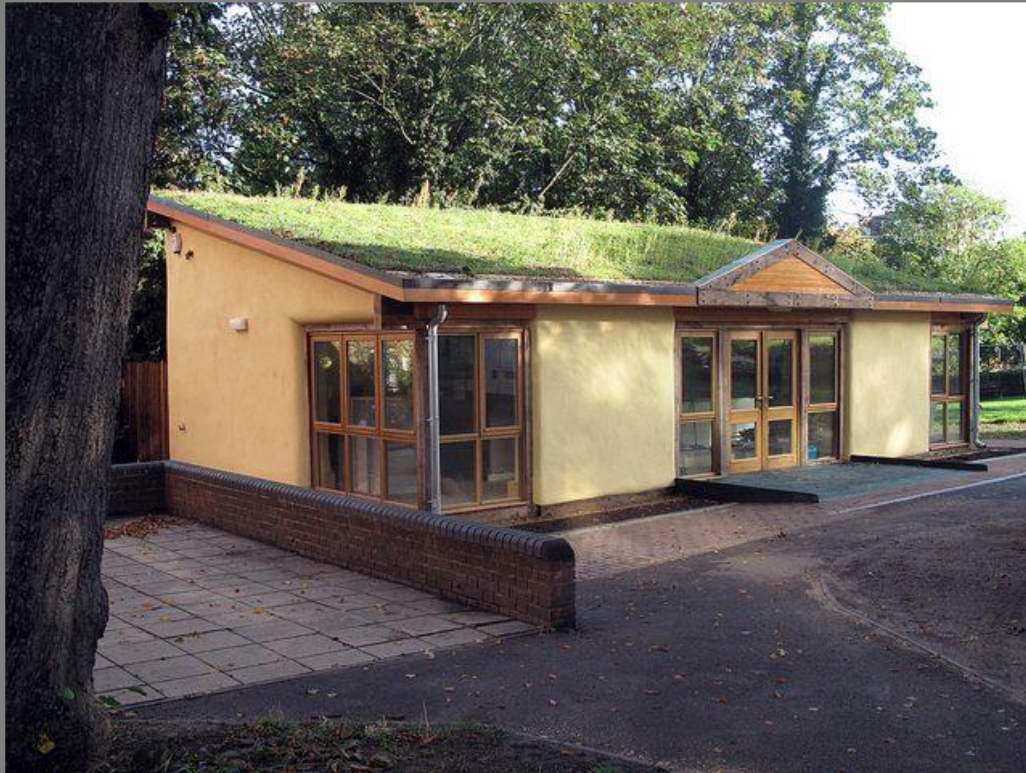
Manor Park Cafe - Sutton

Interest for straw bale building which is accessible to the general public, is also growing too